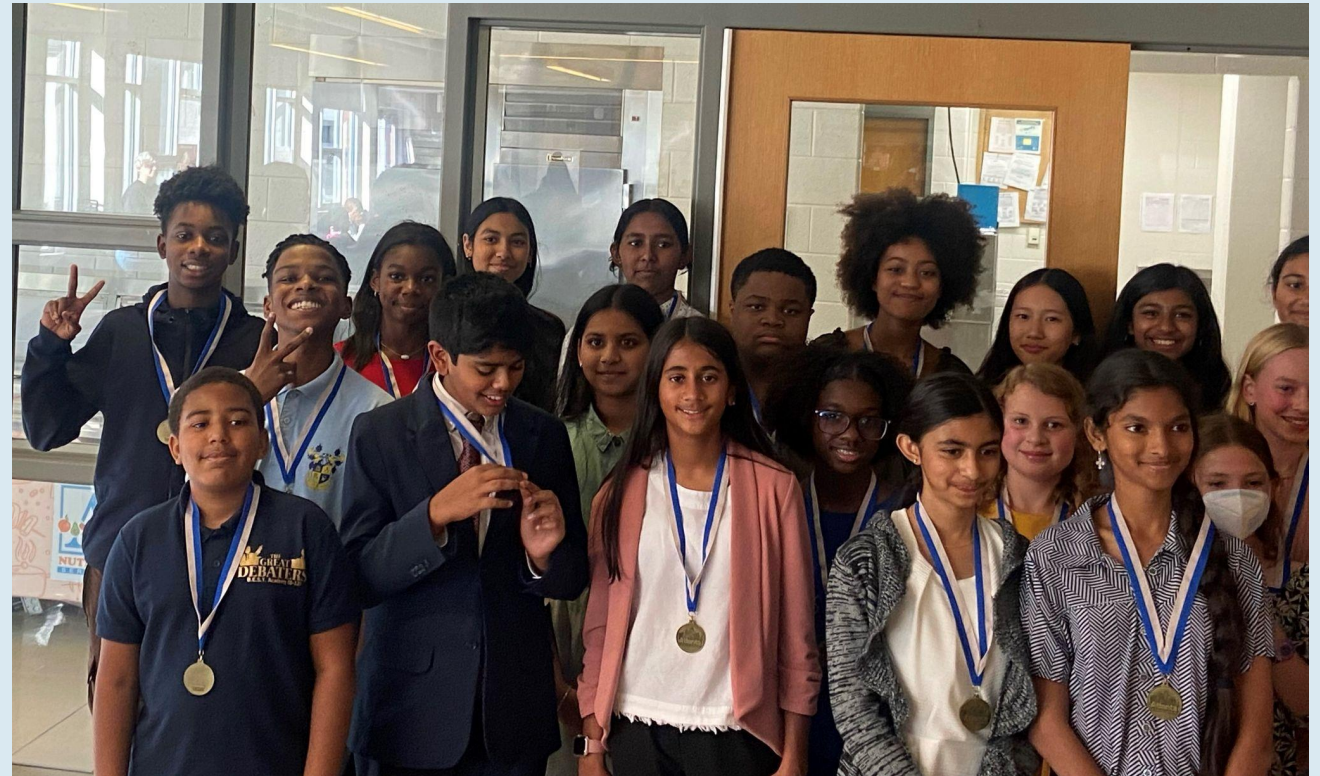
BEST Scholars on the far left with the winning competitors from other middle schools