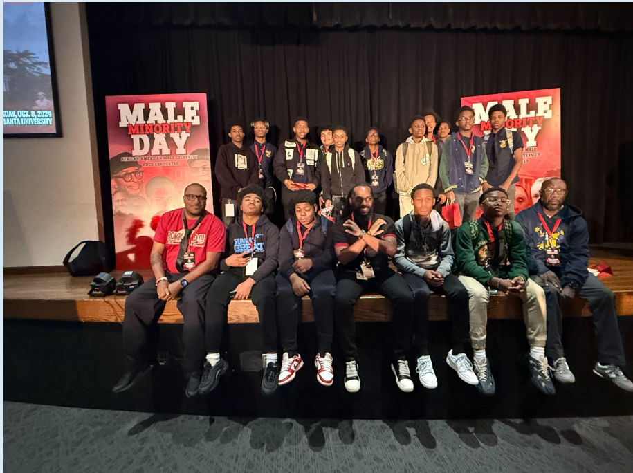
SkillsUSA/TSA students along with advisors

On October 9th, SkillsUSA Audio-Video, Technology, and Film students and TSA Engineering students attended Minority MALE DAY at Clark Atlanta University. They listened to speakers discuss masculinity and the importance of higher education, participated in a necktie ceremony, were introduced to fraternities, and enjoyed a step show. The day concluded with a campus tour and lunch.