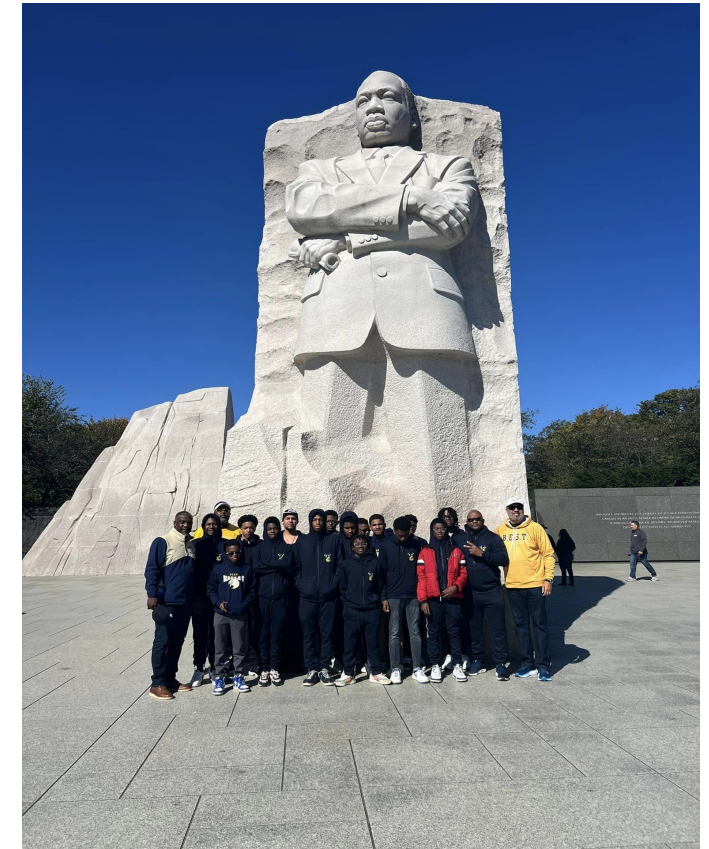
Members of the PODS Delegation and Chaperones